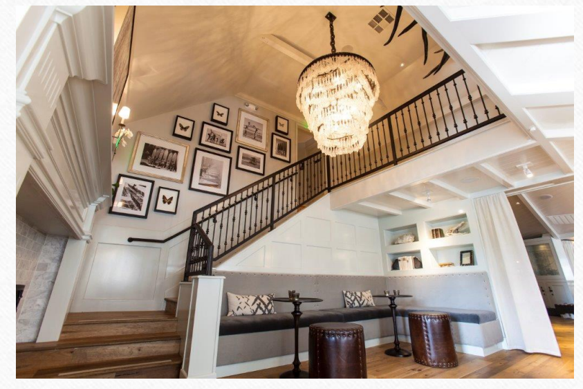
1464 S. Coast Highway Laguna Beach, California